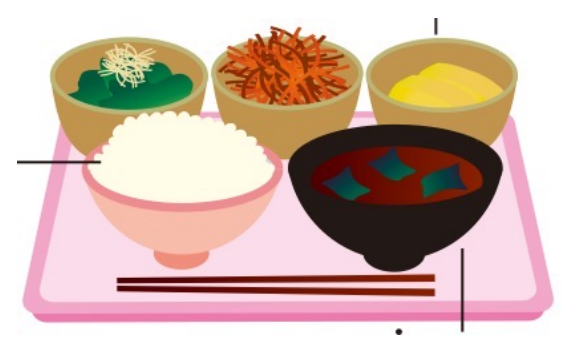
¥100 for a breakfast taking 5 dishes (rice+miso soup +3dishes)