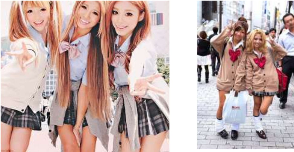
Figure 4. Kogyaru (literally: little girl) is characterized as wearing a school uniform in a stylish way with loose socks, a mini-skirt implying sexual deviance (Kinsella 2013:60).