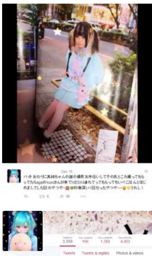
Figure 6. The role of street snap and twitter in Harajuku image construction.

The process of representation occurs within the Harajuku district. If one knows Harajuku well, they can tell where each photo is taken. Harajuku has only been a place but with fashionable people gathering within it, Harajuku has become more than a mere place for young readers. Magazine photos make readers believe that there are many people wearing such fashionable clothes in Harajuku, which leads to the desire to be one of them (Figure 6). Through this process of adding value, Harajuku is commodified.