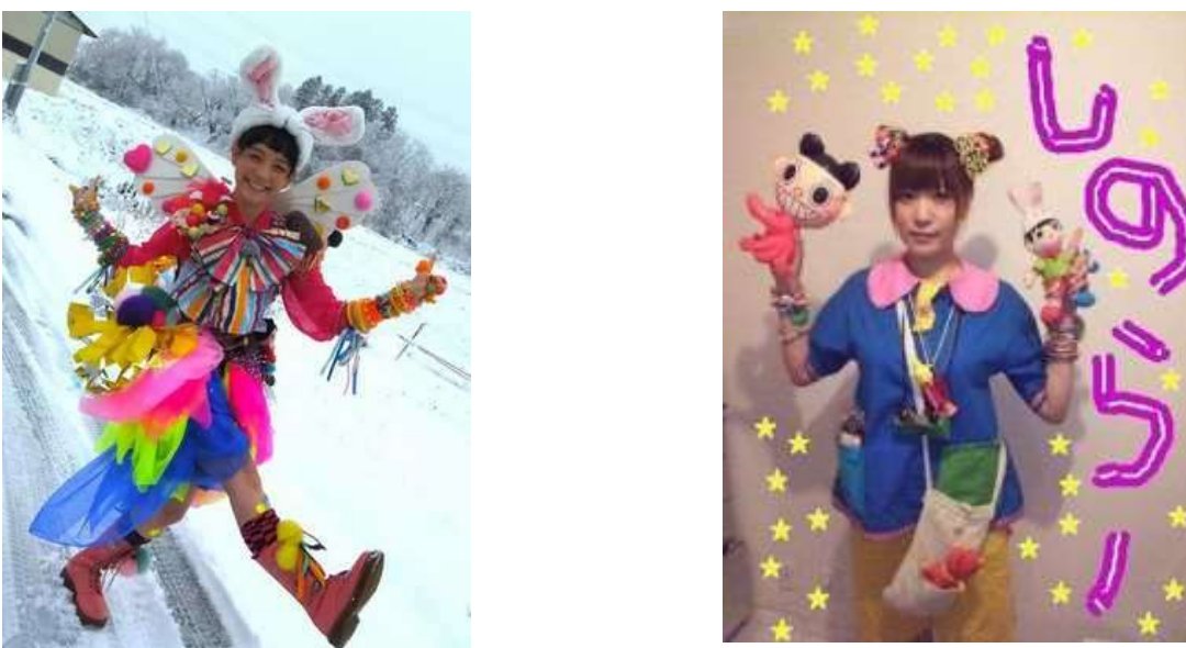
Figure 5. Shinohara Tomoe (left) and Shinora (right)

Then Shinohara Tomoe, a solo singer and talent, debuted in 1996. It was the time when the words Enjokosai , Ruzu sokkusu (loose socks) and Amura (short form of Amuro Namie) were awarded as the most popular words ( ryukou-go taisho ). These events indicated the high time for Kogyaru , with Shinohara popularity propelling it to a social phenomenon. Shinohara Tomoe was characterized with her flamboyant fashion, high-pitched voice and unique movement resembling the act of dancing (Figure 5).