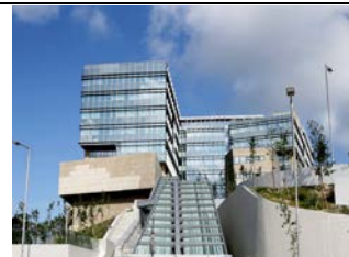
Photo: Lee Shau Kee Business Building