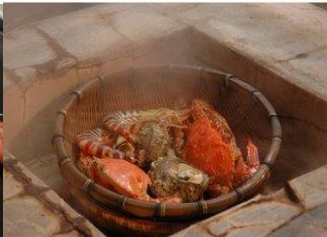
“Hell” Steamed Food