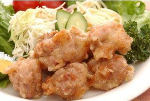
Toriten Chicken Tempura