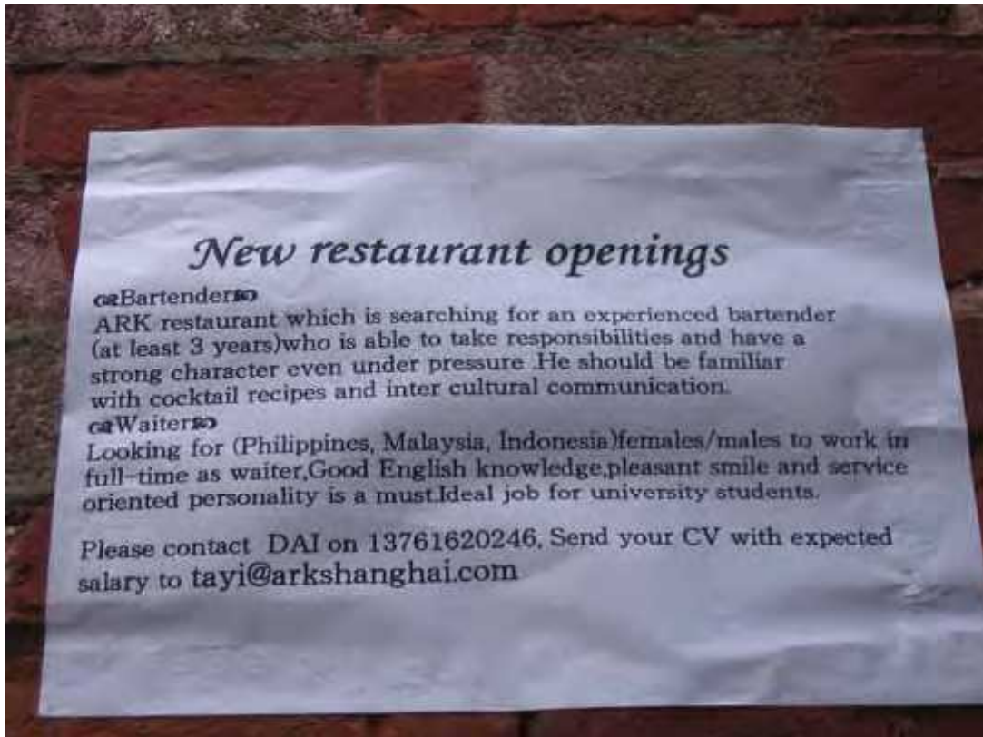
(Fig. 4-20) In fact, this

restaurant also has a branch in Xintiandi.